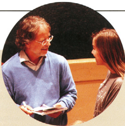
ABOVE Mia Couto in conversation with a student after giving the Neustadt Prize Lecture. More than five hundred attended the event, held on the University of Oklahoma campus in October 2014.

never before have we made so few visits. What could bind us together would be the desire to tell and to listen to stories.